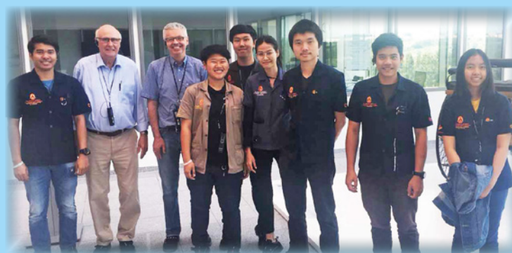
to visit FESTO at Esslingen. Moreover FESTO sponsored their cost of accommodation in Germany.